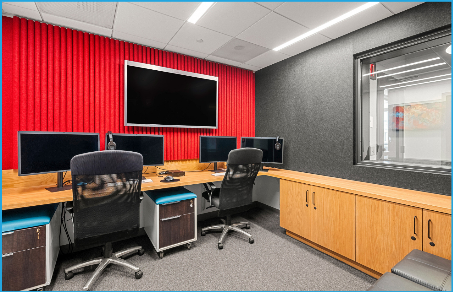
Meryl Streep Center control room.