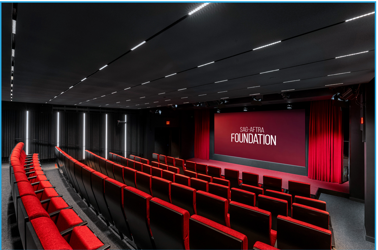
Tom Hanks and Rita Wilson Screening Room.