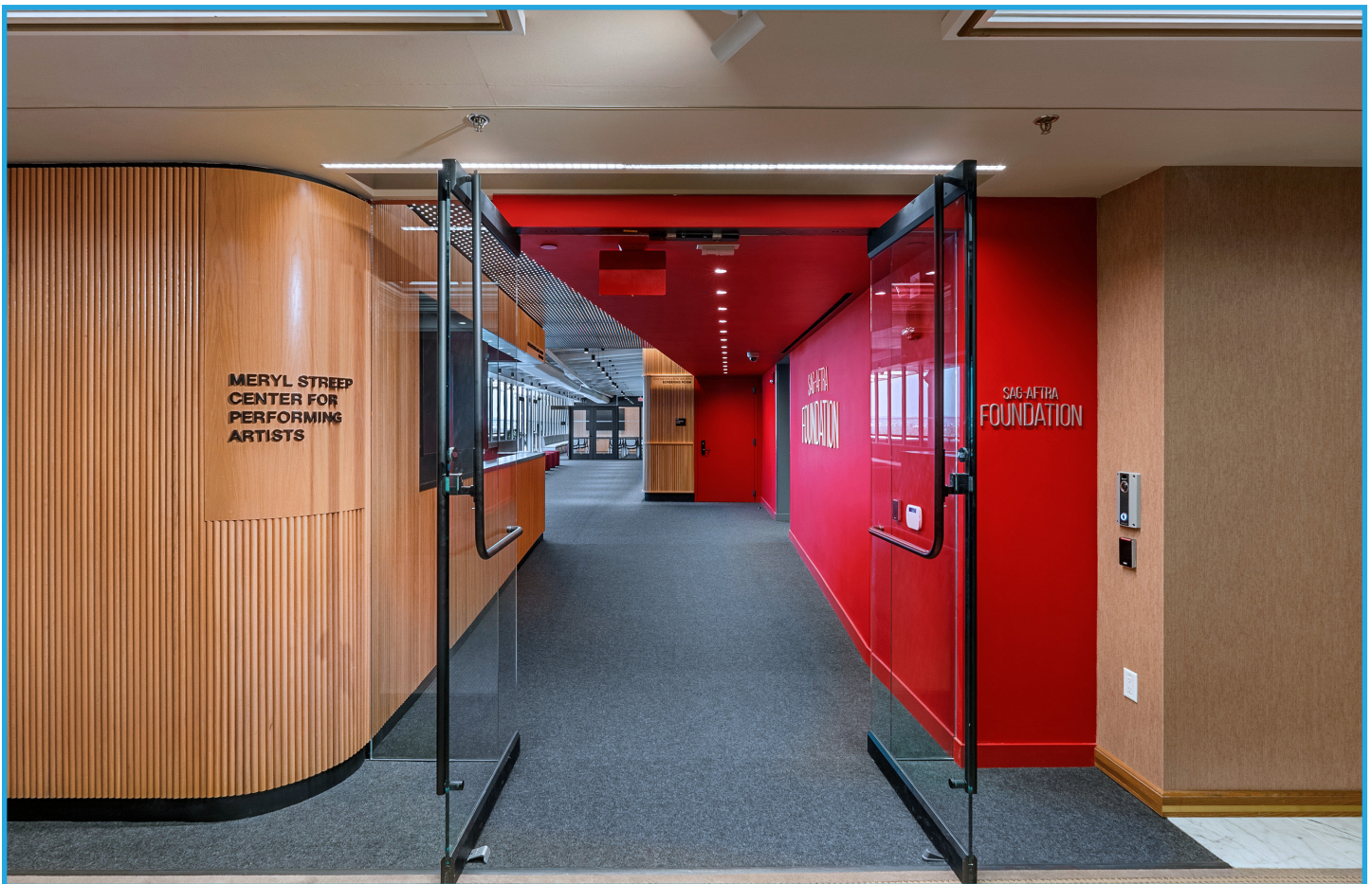
Meryl Streep Center entrance.

To bring this idea to life, the Foundation partnered with Advanced Systems Group (ASG) for their deep technical knowledge and expertise in audio and systems integration. What started as a plan to update a screening room grew into a fully realized center built for modern production, connection, and learning.