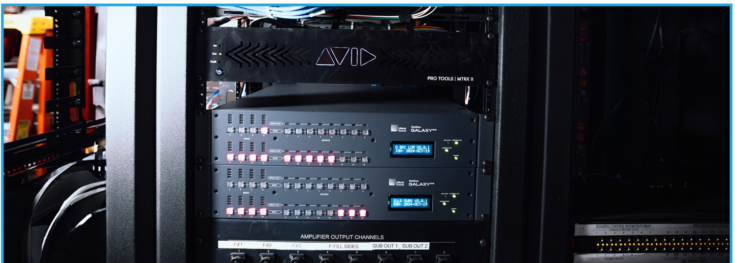
Signal processing rack with AVID MTRX II and a pair of Meyer Sound Galileo GALAXY 816 processors.