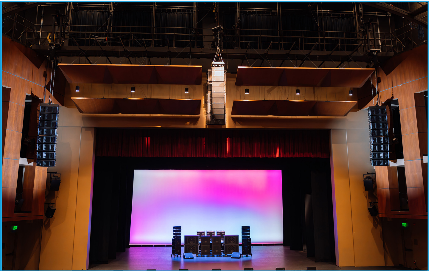
Inside the Gallo Center.