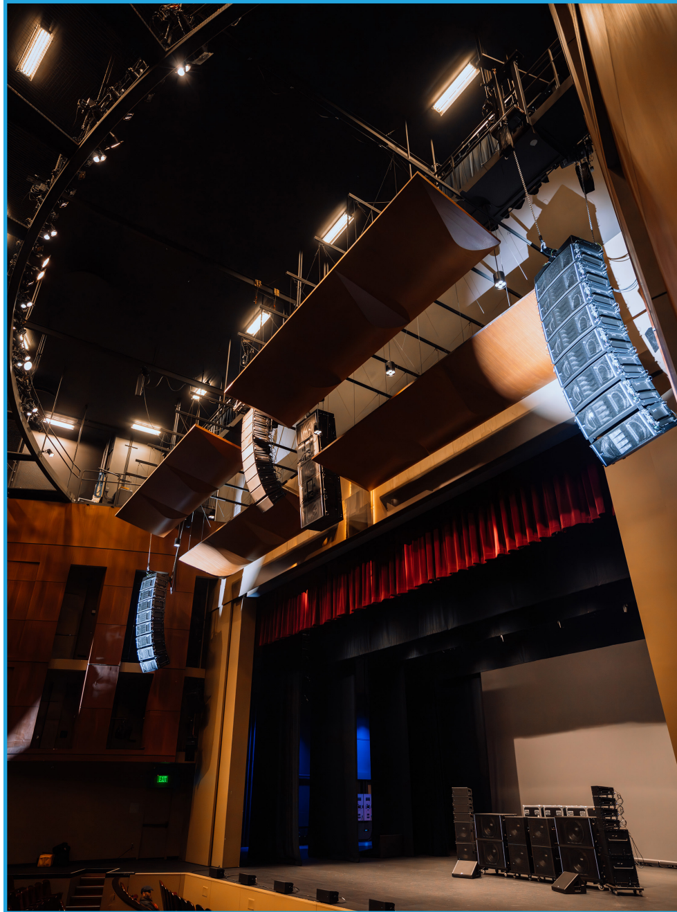
Meyer Sound PANTHER line arrays.